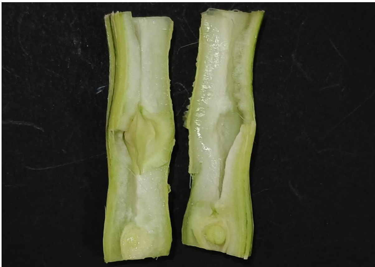
Figure 2: M. oleifera 's fruit pulp for antioxidant DPPH assay

Where, A_0 is the absorbance of the control and A_s is the absorbance of the sample after blank correction.