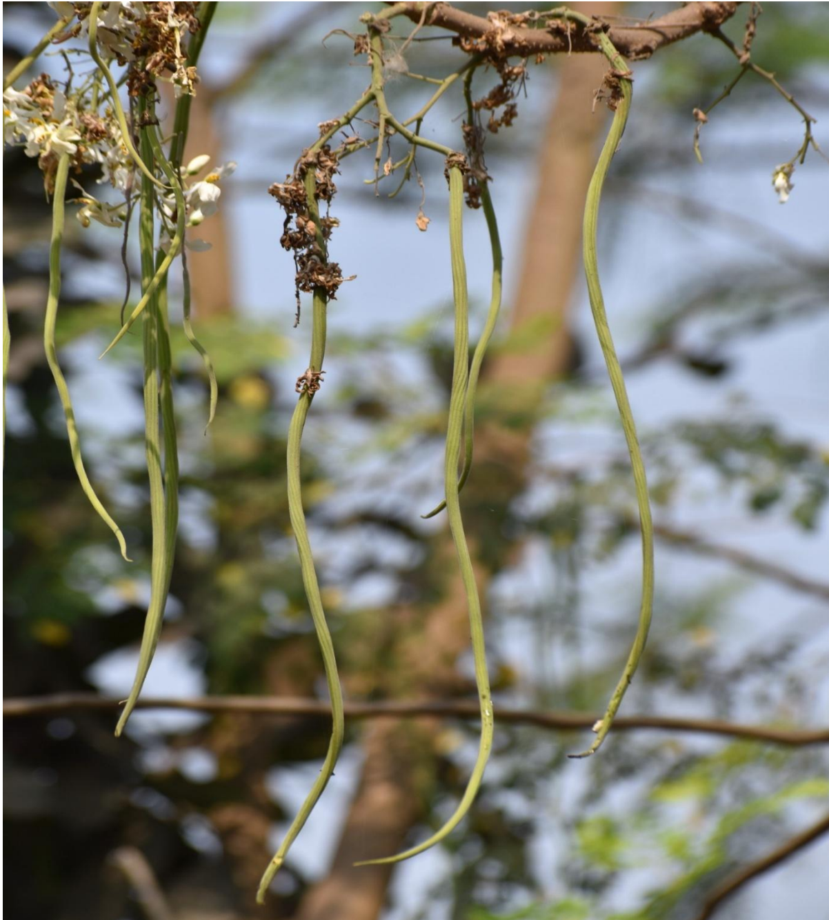
Figure 1: Fruits of M. oleifera

northwestern India and is now widely grown in tropical and subtropical regions across Asia, Africa and Latin America (Karvande et al., 2025). For centuries, it has played a vital role in traditional medicine, food security efforts and indigenous healthcare practices (Pareek et al., 2023; Soto et al., 2025).