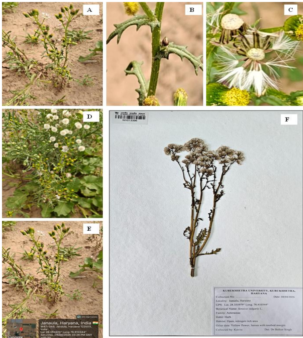
Figure 2: Morphological feature of Senecio vulgaris (A) Habit, (B) Leaves, (C) Close-up of Flower, (D) Flower (E) Photograph of plant with GPS data (F) Herbarium specimen

Distribution: This species has previously been reported from different parts of India including Tamil Nadu, Assam (Sharma, 1995); Kashmir (Kaul, 1972); Rajasthan (Todarwal, 2016); Madhya Pradesh, Andhra Pradesh, Himachal Pradesh, Uttarakhand, Kerala, Jharkhand, West Bengal, Karnataka based on records on iNaturalist, (2026) and Haryana (Present record).