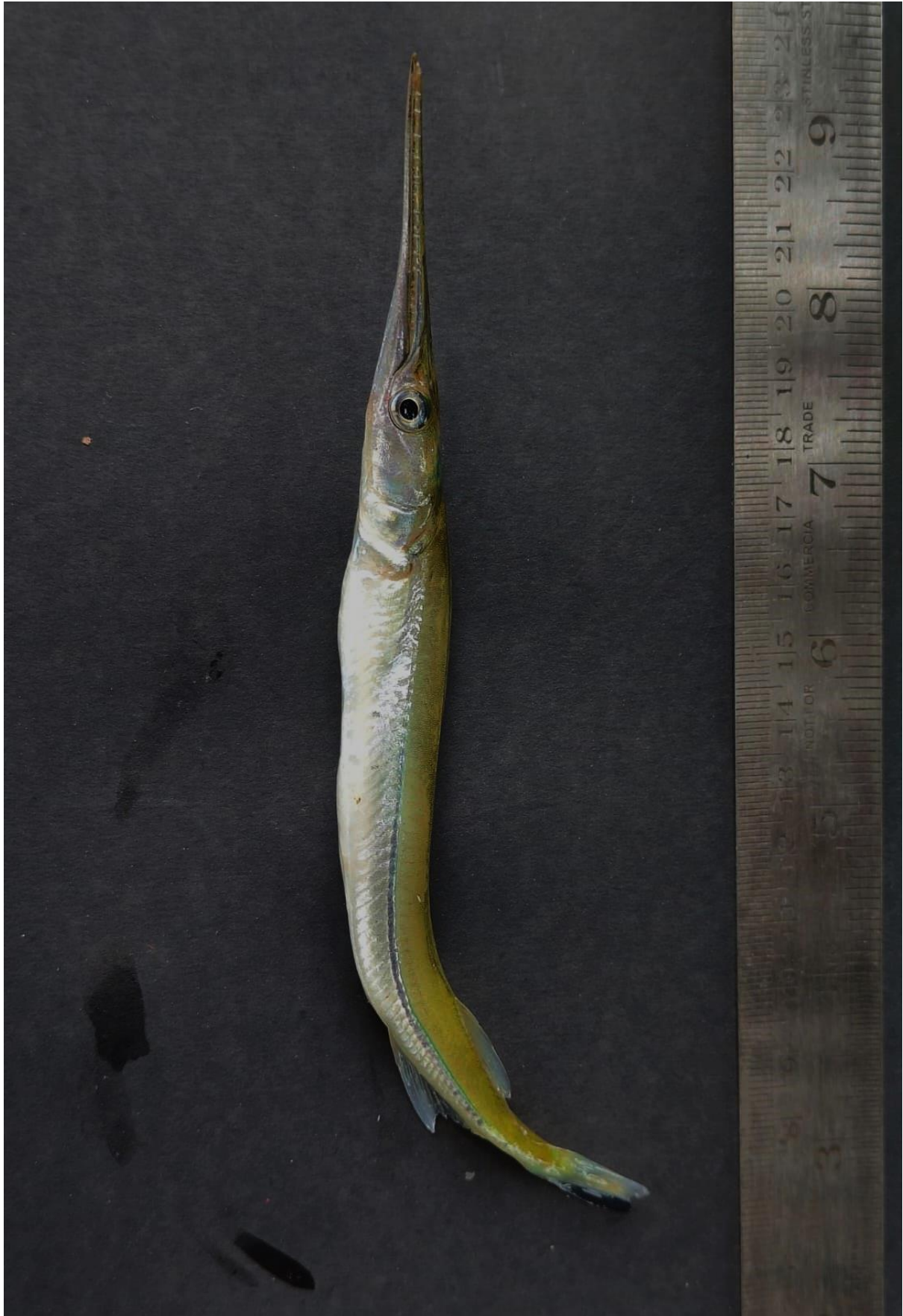
Figure 6: Xenentodon cancila (Gang tur)