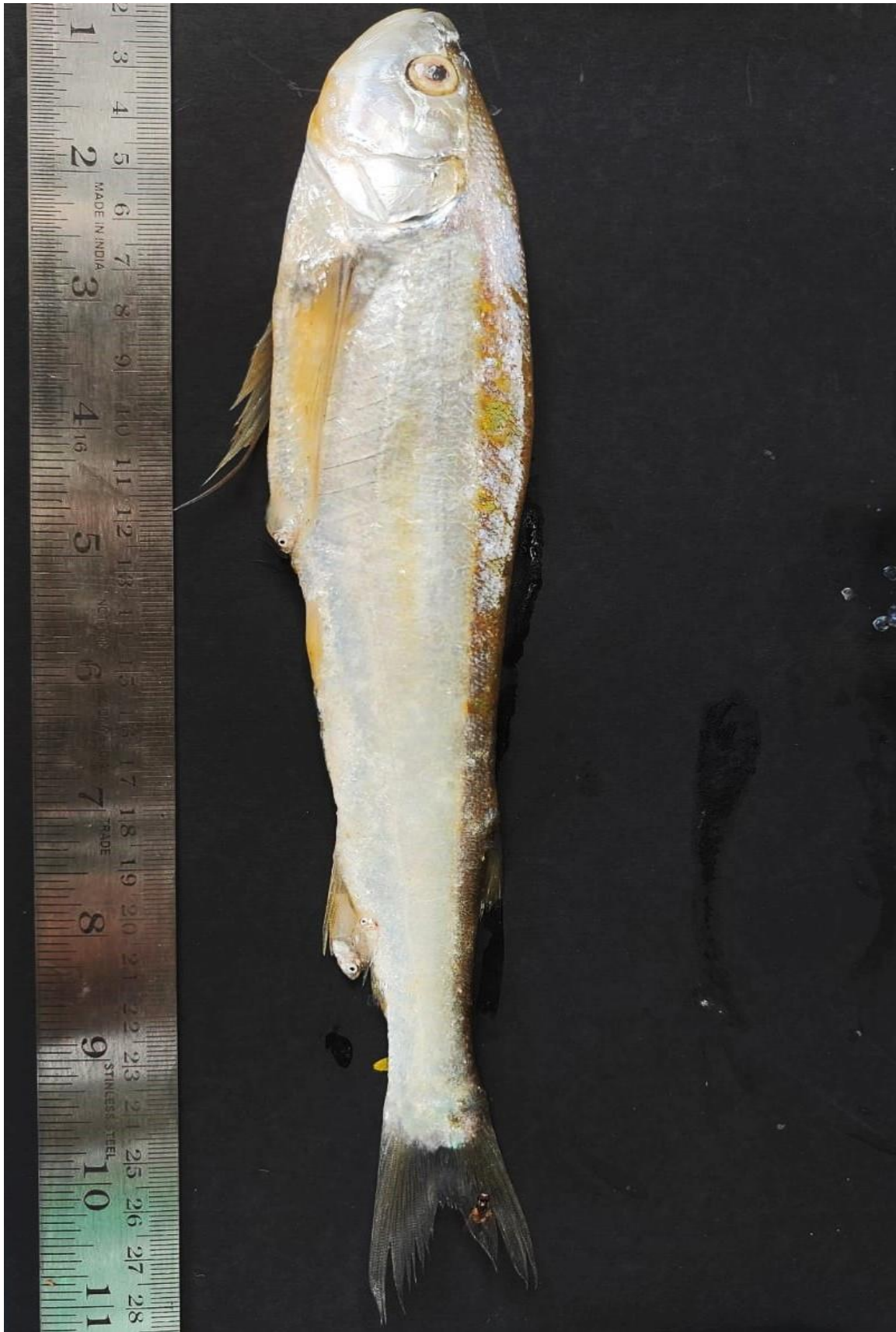
Figure 3: Salmostoma bacaila (Banspatta)