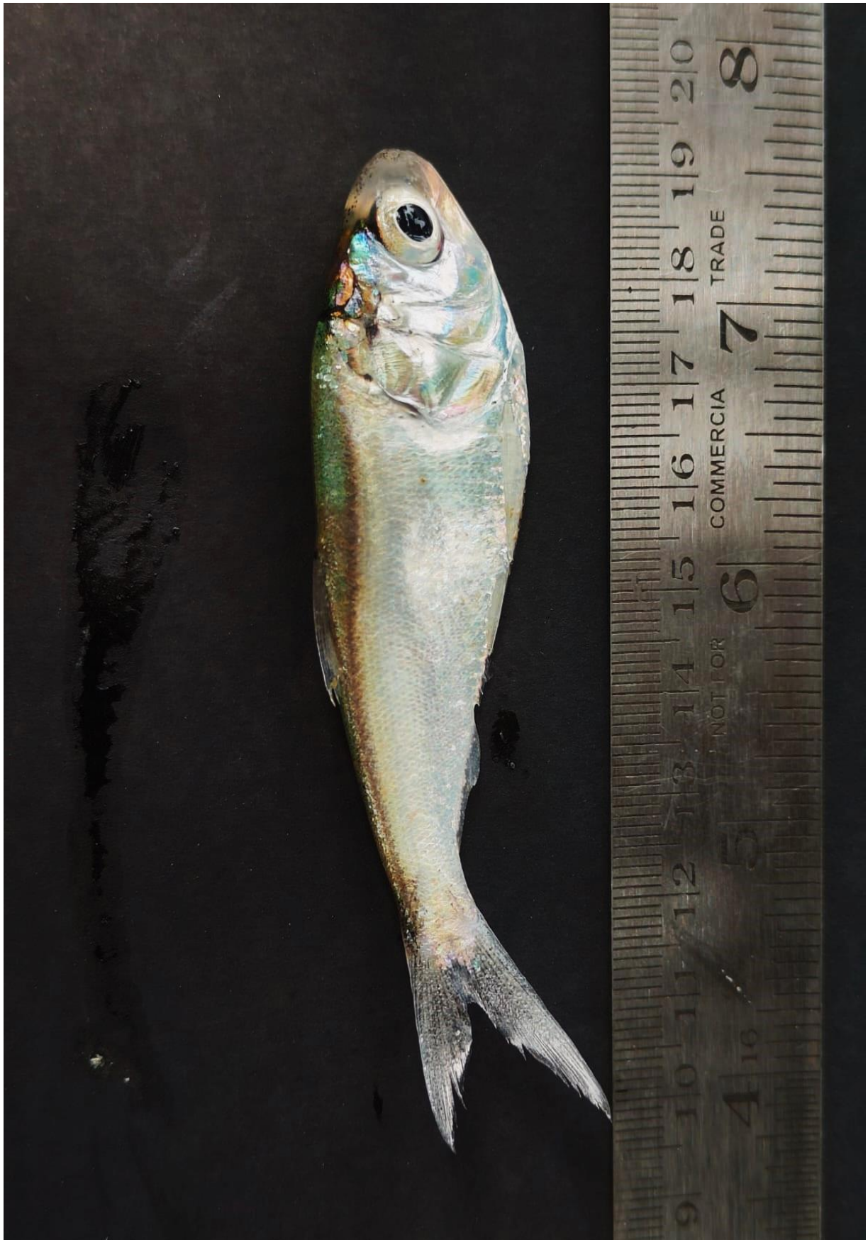
Figure 2: Gudusia chapra (Khairi)