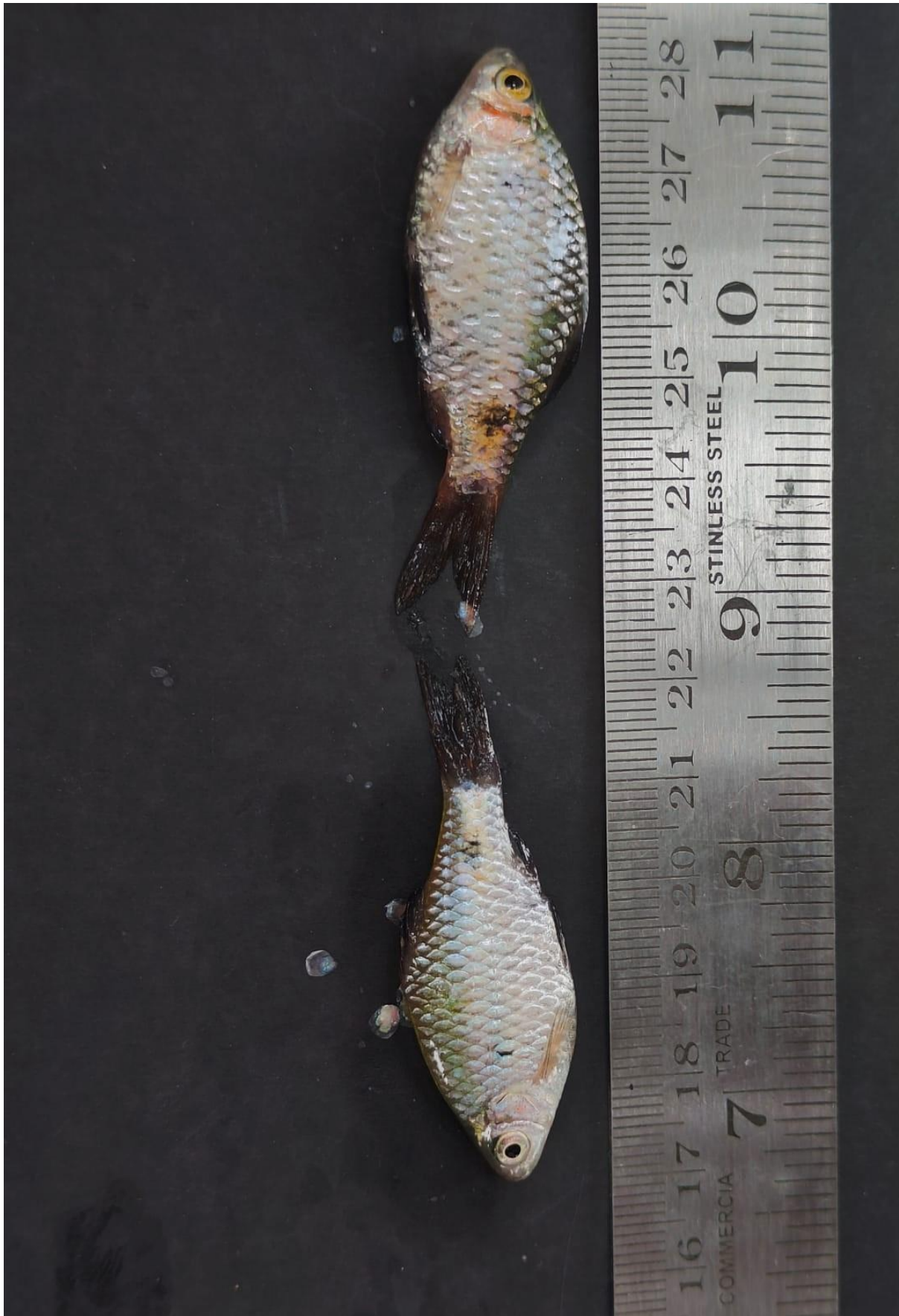
Figure 4: Pethia ticto (Titpunti, Pothi)