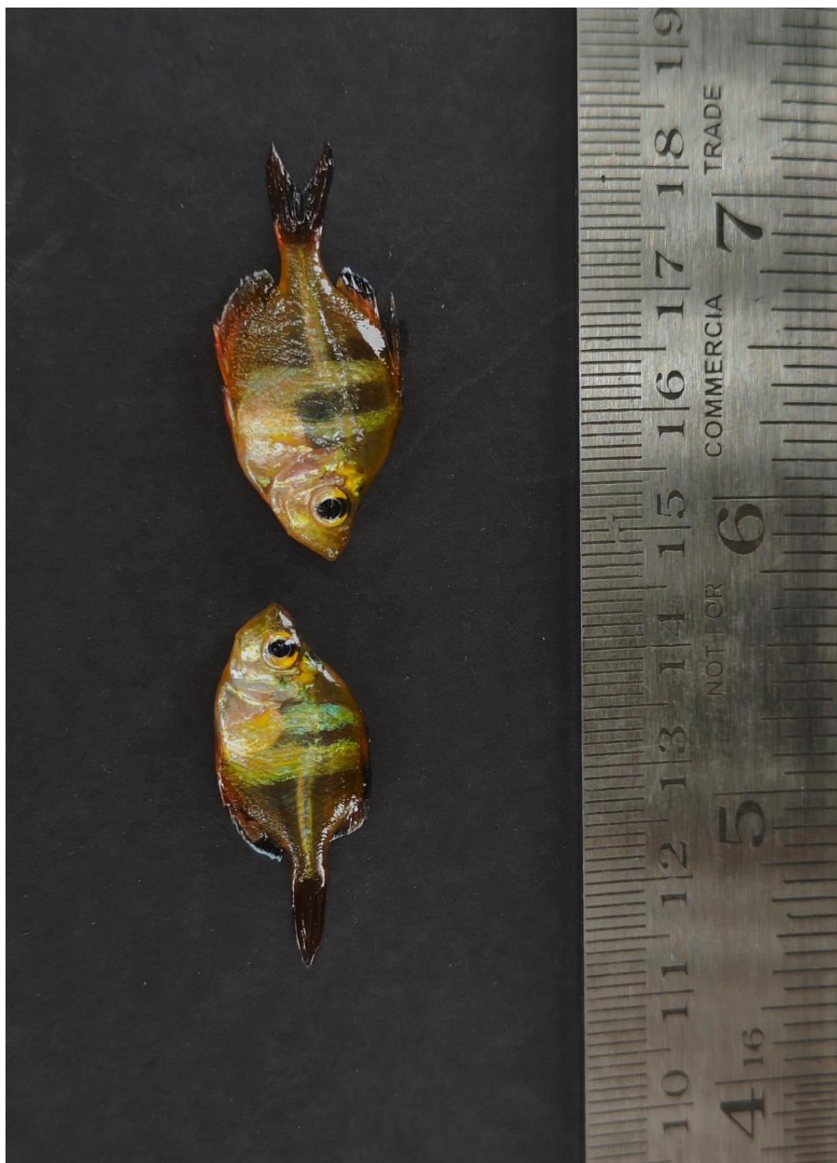
Figure 7: Parambassis lala (Chanda)