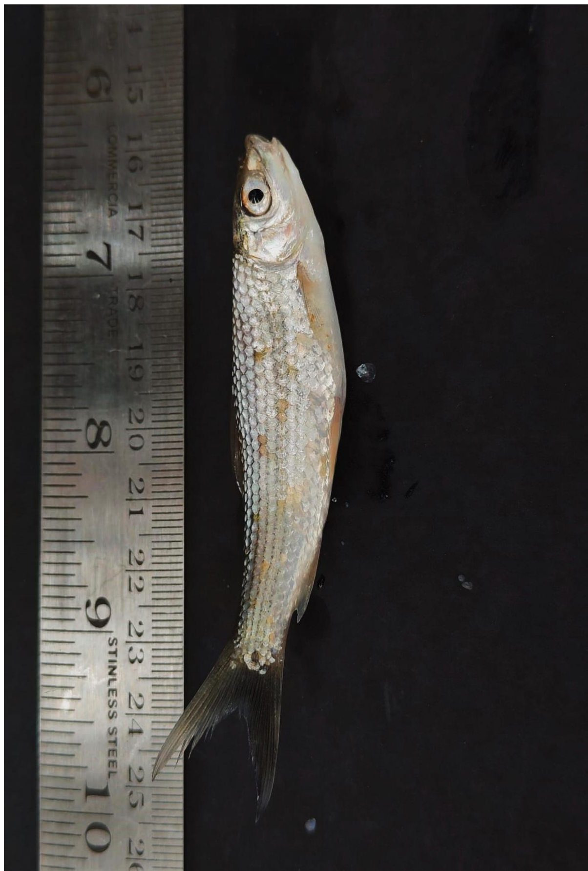
Figure 5: Labeo bata (Bata)