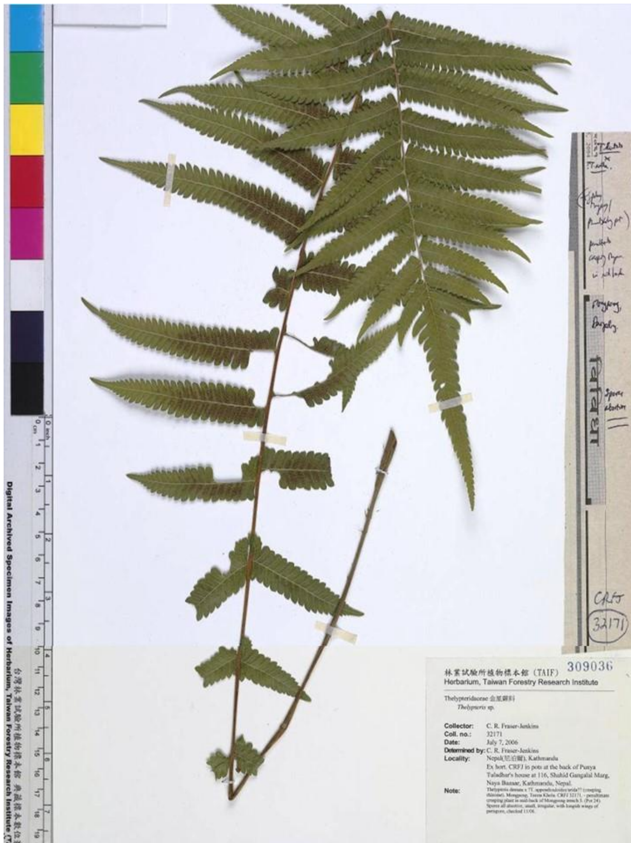
Figure 3: Holotype of Thelypteris x dentarida Fraser-Jenk. (TAIF.309036, © Herbarium of Taiwan Forestry Research Institute, Taipei)