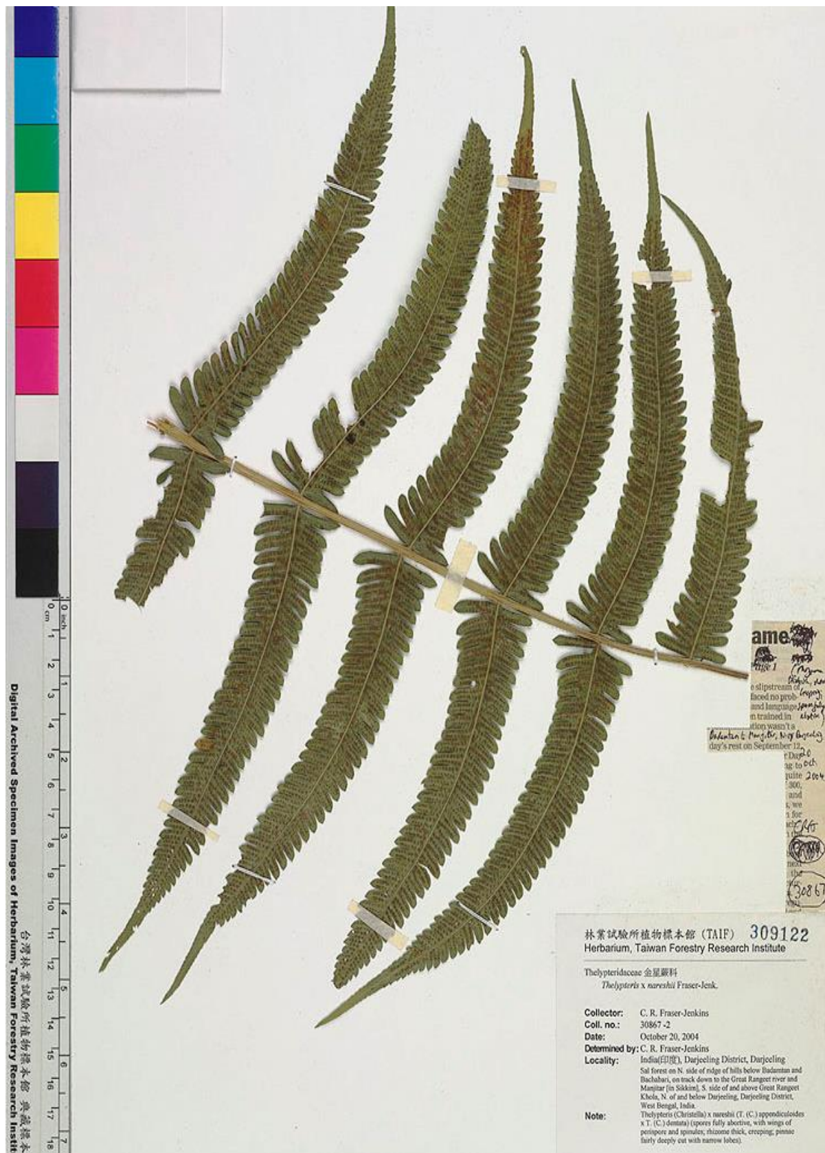
Figure 7: Herbarium specimen of Thelypteris x nareshii Fraser-Jenk. (TAIF.309122)