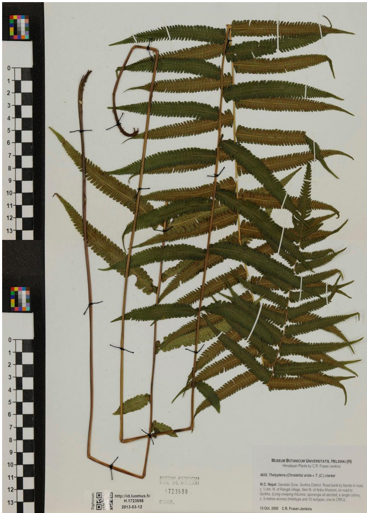
Figure 4: Holotype of Thelypteris × gorkhalensis Fraser-Jenk. (H.1723698)