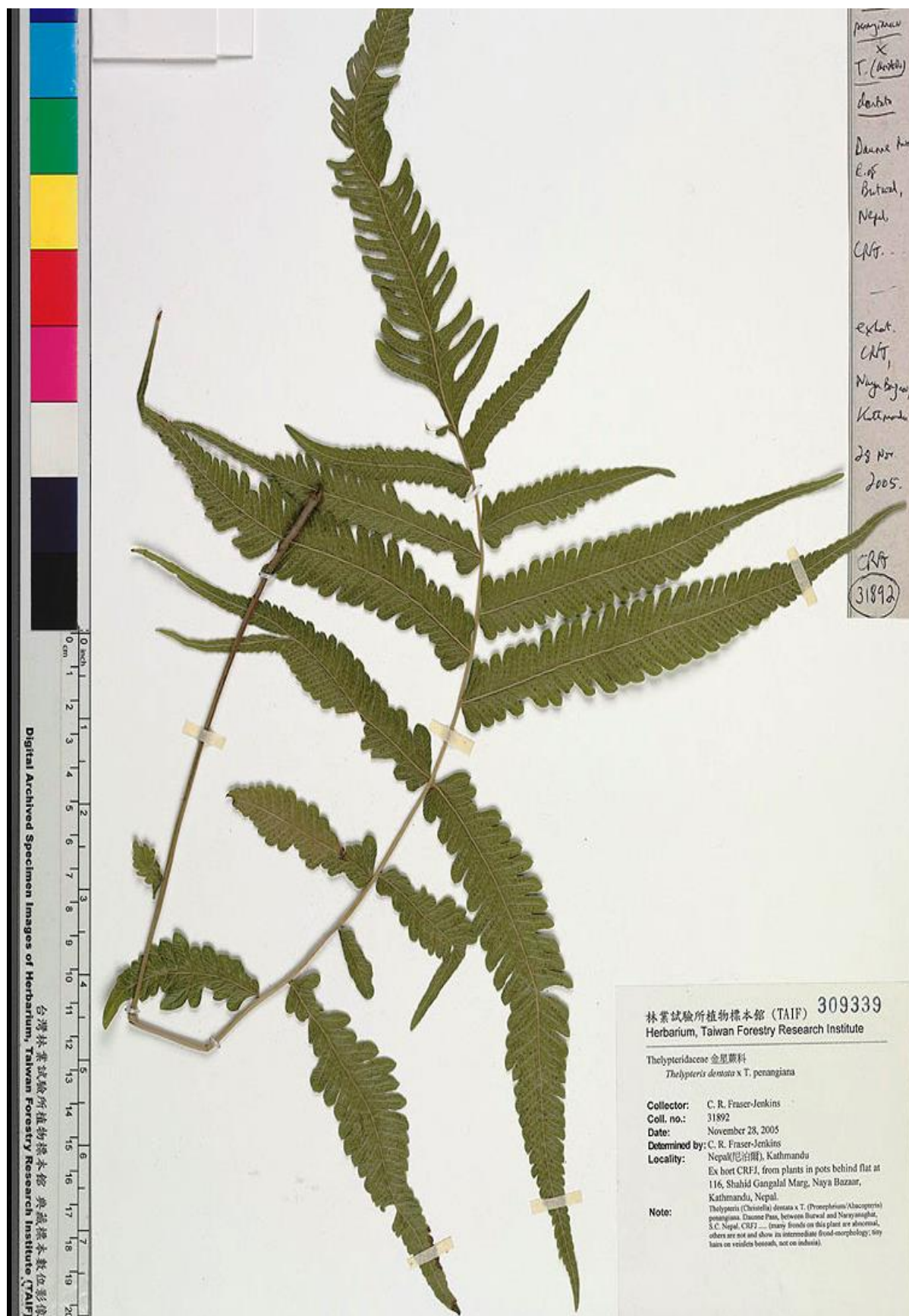
Figure 9: Holotype of Thelypteris × nepalensis Fraser-Jenk. (TAIF.309339, © Herbarium of Taiwan Forestry Research Institute, Taipei)