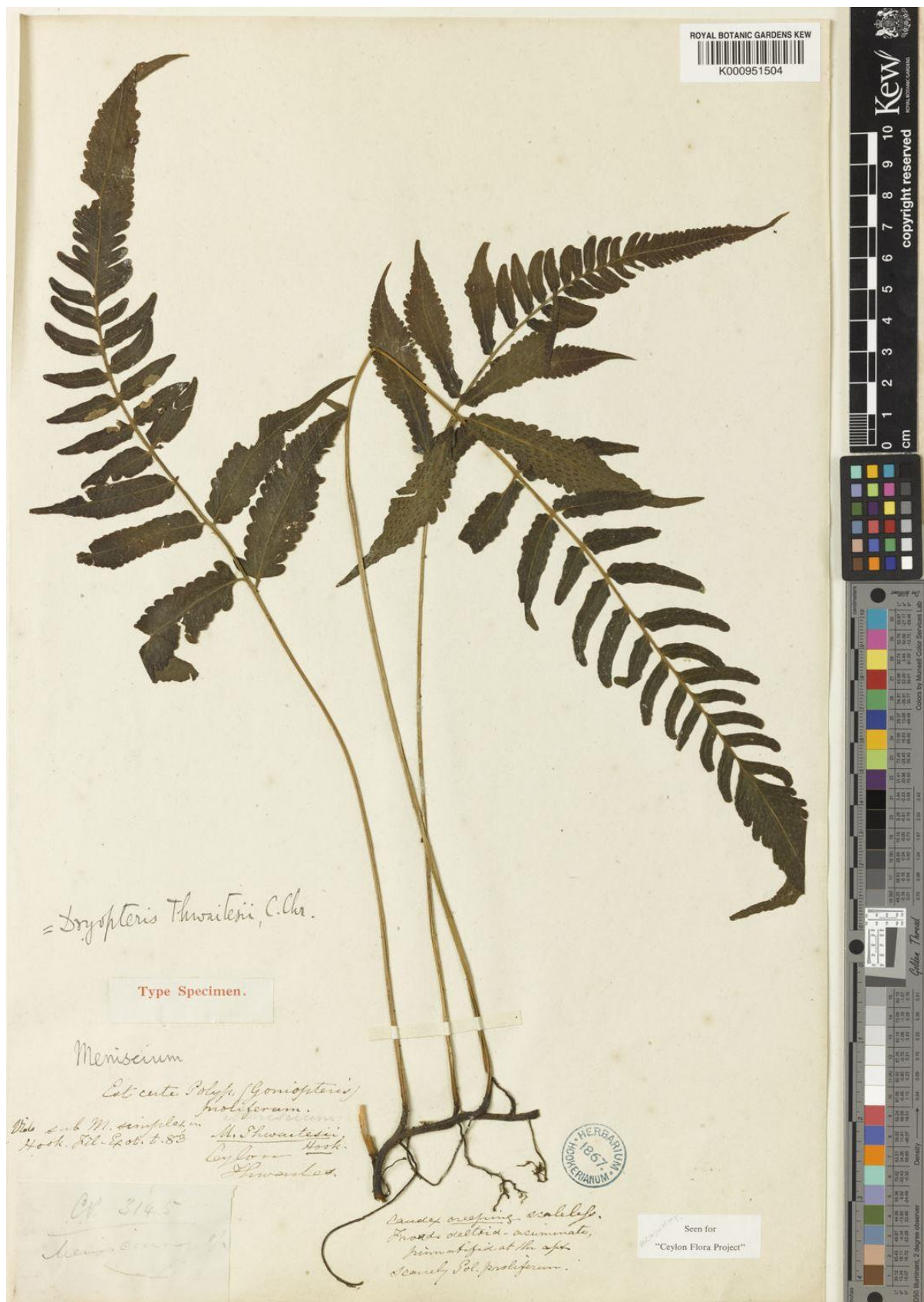
Figure 1: Holotype of Meniscium x thwaitesii Hook. (K000951504,)