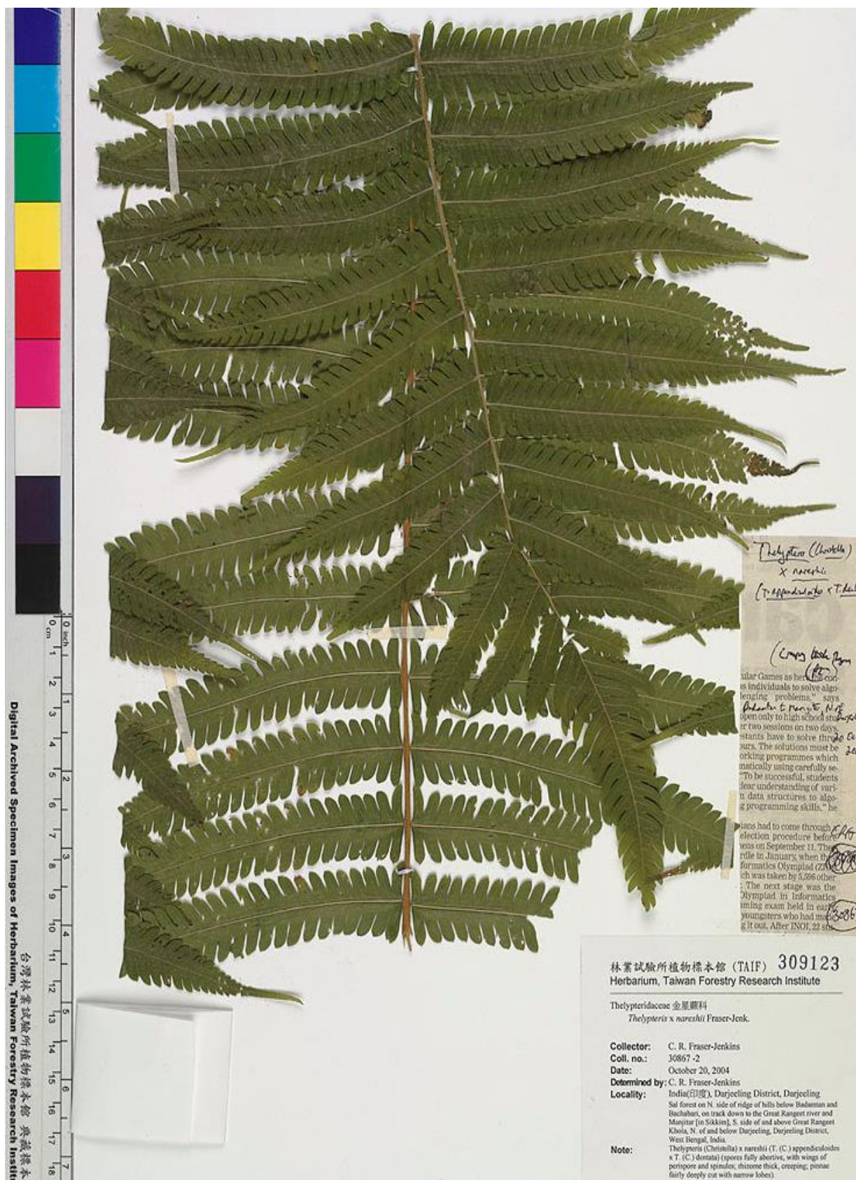
Figure 8: Herbarium specimen of Thelypteris x nareshii Fraser-Jenk. (TAIF.309123, © Herbarium of Taiwan Forestry Research Institute, Taipei)