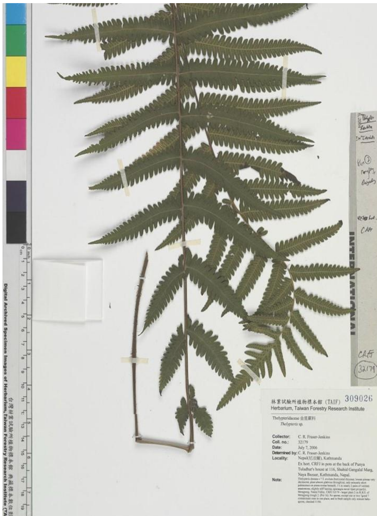
Figure 5: Holotype of Thelypteris × inexpectata Fraser-Jenk. (TAIF. 309026)