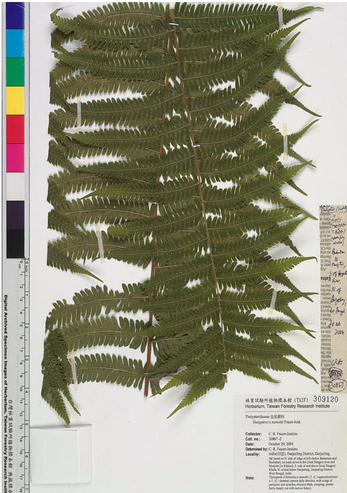
Figure 6: Herbarium specimen of Thelypteris x nareshii Fraser-Jenk. (TAIF.309120)